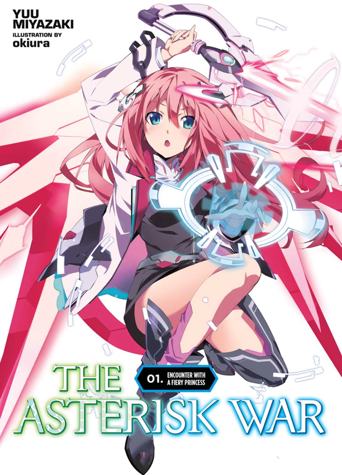
ILLUSTRATION BY okiura